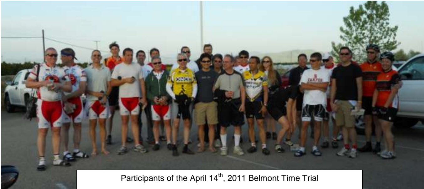
Participants of the April 14 th , 2011 Belmont Time Trial